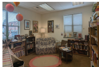
St. Anthony's Library 2nd Floor of Parish Life Center

Open: Mon-Thurs 10am-3pm Wednesdays 10am-8pm