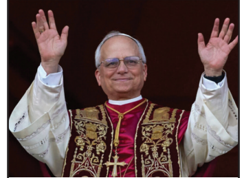
Pope Leo XIV

Welcome to our new Pope from the United States!