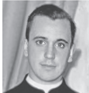
As a seminarian at Villa Devota