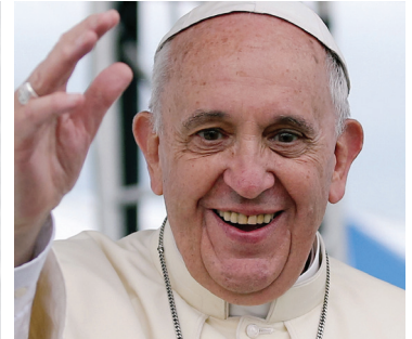
As Pope of the Roman Catholic Church

"O God, faithful rewarder of souls, grant that your departed servant Pope Francis, whom you made successor of Peter and shepherd of your Church, may happily enjoy forever in your presence in heaven the mysteries of your grace and compassion, which he faithfully ministered on earth. Through our Lord Jesus Christ, your Son, who lives and reigns with you in the unity of the Holy Spirit, God, forever and ever."