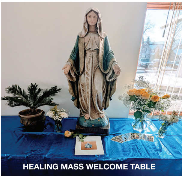
HEALING MASS WELCOME TABLE