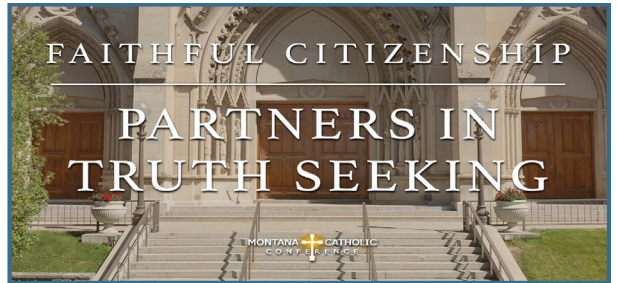
Partners in Truth Seeking, Montana Catholic Conference

In this first installment of 12-part Into Life video series, the Sisters of Life issue a profound and moving invitation to God's call to uphold human life. The Sisters reveal that authentically pro-life activity is a response to God's love, and that it is not about labels or abstract ideas. Instead, we are called to commit to authentic relationships, in which we pray, love, and listen so that we may promote the infinite dignity of life.